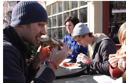
Enjoying a meal downtown Harrisburg

for Jesus, living selfless and sacrificial lives, and committed to prayer and to the glory of Jesus in their city and in the nations. So, yeah, we felt at home. Over the next couple of days, we were blessed to spend time in prayer and worship and fellowship with the Fire&Fragrance crew, developing a new friendship that will